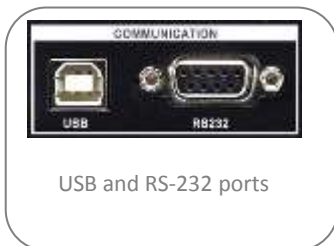
USB and RS-232 ports

PowerWalker ATS (Automatic Transfer Switch) also known as STS (Static Transfer Switch) is designed with two independent power inlets to supply power to the load from primary power source. Should primary power source fail, the secondary will automatically backup the connected equipment without any interruption. The transfer time from one to another is seamless to the connected equipment. After switching to a secondary power source, the ATS can also switch power back to the primary input when power to the primary input is restored.