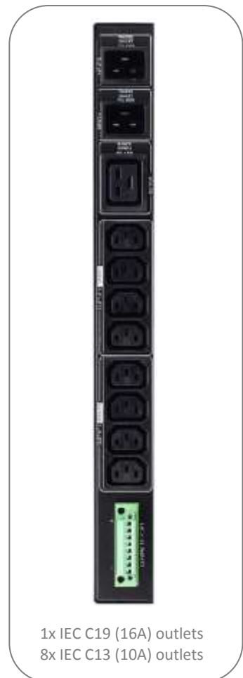
1x IEC C19 (16A) outlets 8x IEC C13 (10A) outlets